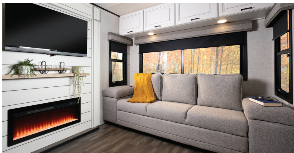
2025 Open Range 322RLS